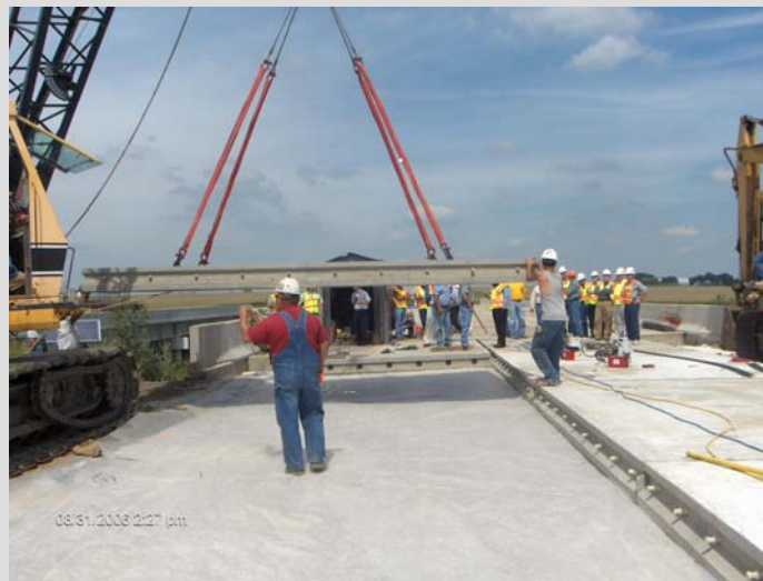
Precast pavement for bridge approach in Iowa